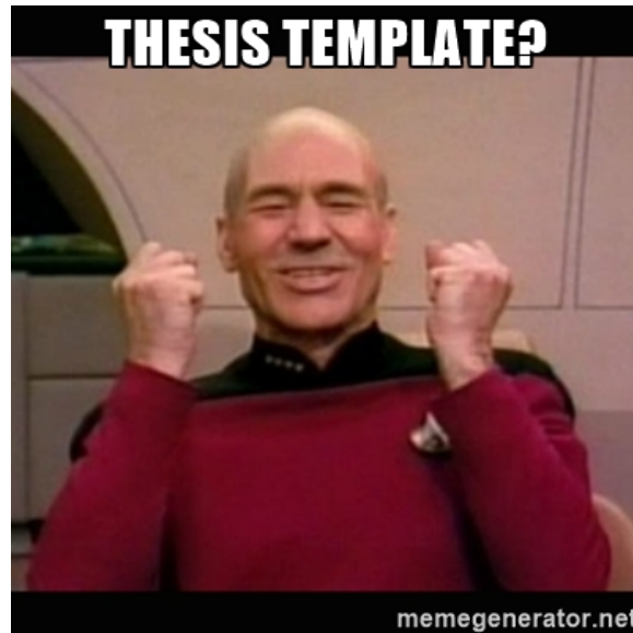
Figure 1.1: Glad to have a thesis class