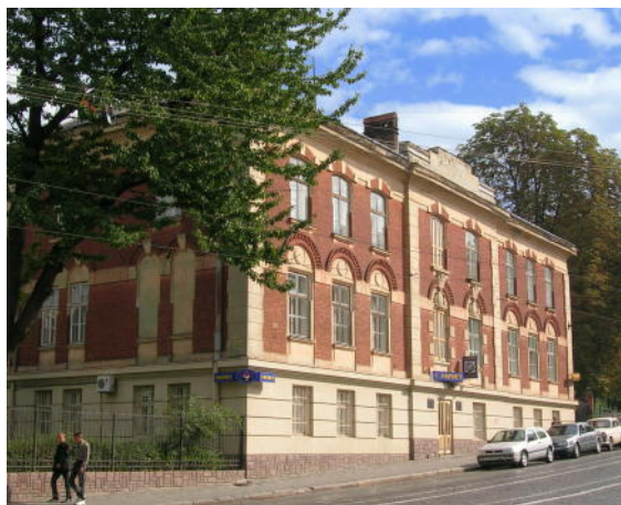
Figure 2. This is a sample of a bitmap image. This cosy building homes the Institute for Condensed Matter Physics and the CMP Editorial Office too.

Roughly speaking, there are two types of electronic figures: vector graphics and bitmap graphics. A vector image is a set of arranged objects: lines, polygons, ellipses, shades, characters, etc. Such an image allows almost arbitrary scaling without loss of quality. Vector images are typically charts, plots, diagrams, etc., produced by various computer software. A bitmap image is a two-dimensional array of pixels (PICTure'S ELEments) or "dots". Continuous tone photographs are their the most widespread samples (like figure 2). Image quality is determined by DPI (Dot Per Inch — a pretty self-explained definition). Below, there are necessary requirements for each type of images.